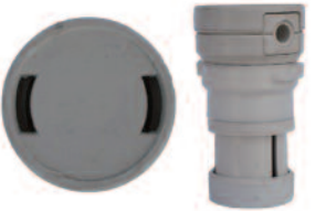
REPLACE CARETAKER 99 (APPROX RELEASE 1991)

RETRO COLORS WHITE BLACK BEIGE CREAM MEDIUM GRAY