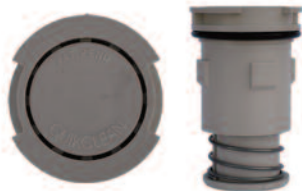
REPLACE A&A GAMMA 3 (APPROX RELEASE 2004)