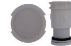
REPLACE NET 'N' CLEAN (APPROX RELEASE 1999)

RETRO COLORS WHITE GRAY BLACK TAUPE LIGHT GRAY CREAM BLACK