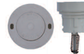
REPLACE A&A QUICKCLEAN 1 (APPROX RELEASE 1981)

RETRO COLORS WHITE BLACK BEIGE CREAM MEDIUM GRAY