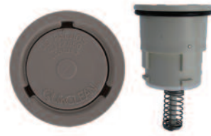
REPLACE A&A QUICKCLEAN 2 (APPROX RELEASE 1992)

RETRO COLORS WHITE BLACK BEIGE CREAM MEDIUM GRAY